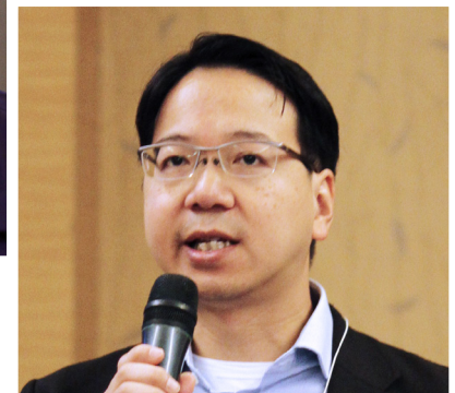
Charles Mok, Legislative Council, Hong Kong