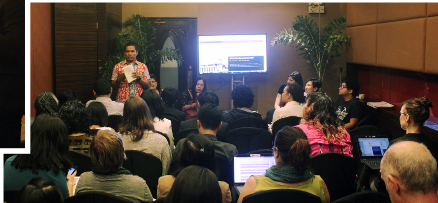
Cyber Sex(y): Sexual Speech, Privacy, and Freedom of Expression