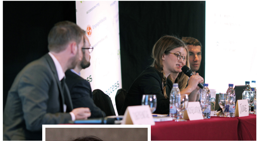
Prosecutor v.s. Perpetrator X: A Mock Debate on the Potential for Using Technology for Truth