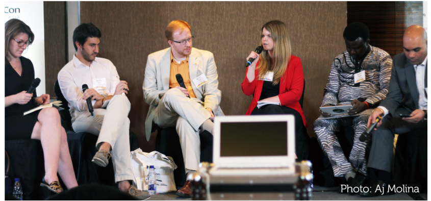
The 'Open Internet' v.s. Net Neutrality