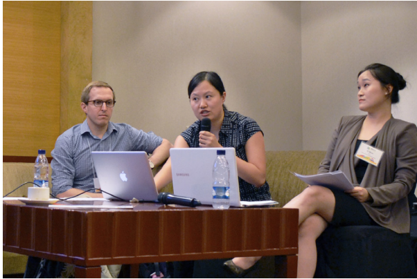
Strength in Numbers: Transparency Reporting & the Search for Meaning